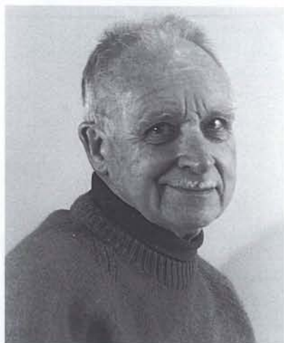
(above) Portrait of Sir Robert Helpmann 35mm slide