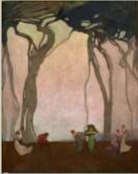
Sydney Long: Fantasy , ca.1914, Art Gallery of New South Wales. Purchased under the terms of the Florence Turner Blake Bequest, 1971.