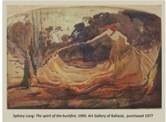
Sydney Long: The spirit of the bushfire , 1900. Art Gallery of Ballarat, purchased 1977