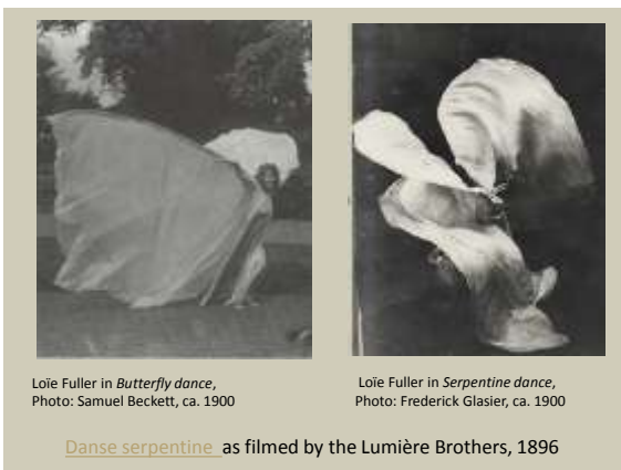
Loie Fuller in Butterfly dance , Photo: Samuel Beckett, ca. 1900