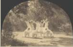
(left) Grecian dance, 1924.