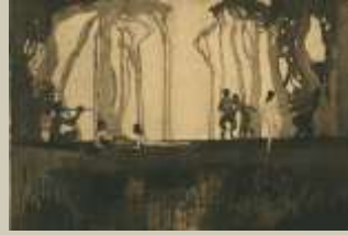
Sydney Long, Pan , 1919 line etching and aquatint National Gallery of Australia The Oscar Paul Collection