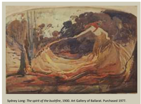
Sydney Long: The spirit of the bushfire , 1900. Art Gallery of Ballarat. Purchased 1977.

Danse serpentine as filmed by the Lumière Brothers, 1896