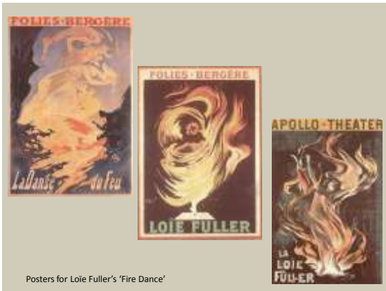
Posters for Loie Fuller's 'Fire Dance'